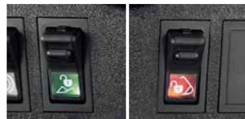
Safety Switch (Loader) Safety Switch (Backhoe)